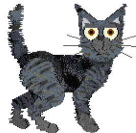
Lis/Shenzai's Thundercloud of Blue Storm "Thunder" Owned by ShenzaiBird

Have an upcoming event in March you'd like featured? E-mail xoops@fantazzled.com !