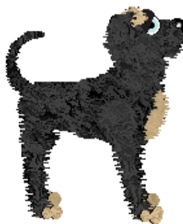
Wild Road's Demon Queen "Morrigan" Owned by Nightwish @ The Wild Road