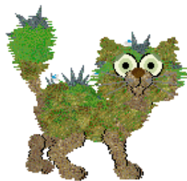
Swallowtail/FK's Mossballz in Bloom "Delphinium" Owned by Megan @ Oasis